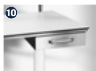
Drawer stainless steel