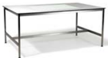
Table for inspection and folding of linen. The tabletop is made of a high pressure (HP) core material in a soft white color and is equipped with a LED illuminated inspection surface. The generous size of the table allows comfortable work with large dressing sheets. Work can be carried out comfortably either standing or sitting. The frame is made of polished stainless steel. 100–240 V / 50/60 Hz.